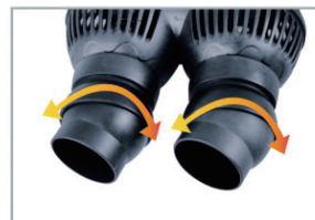
The modulator adjust the flow direction